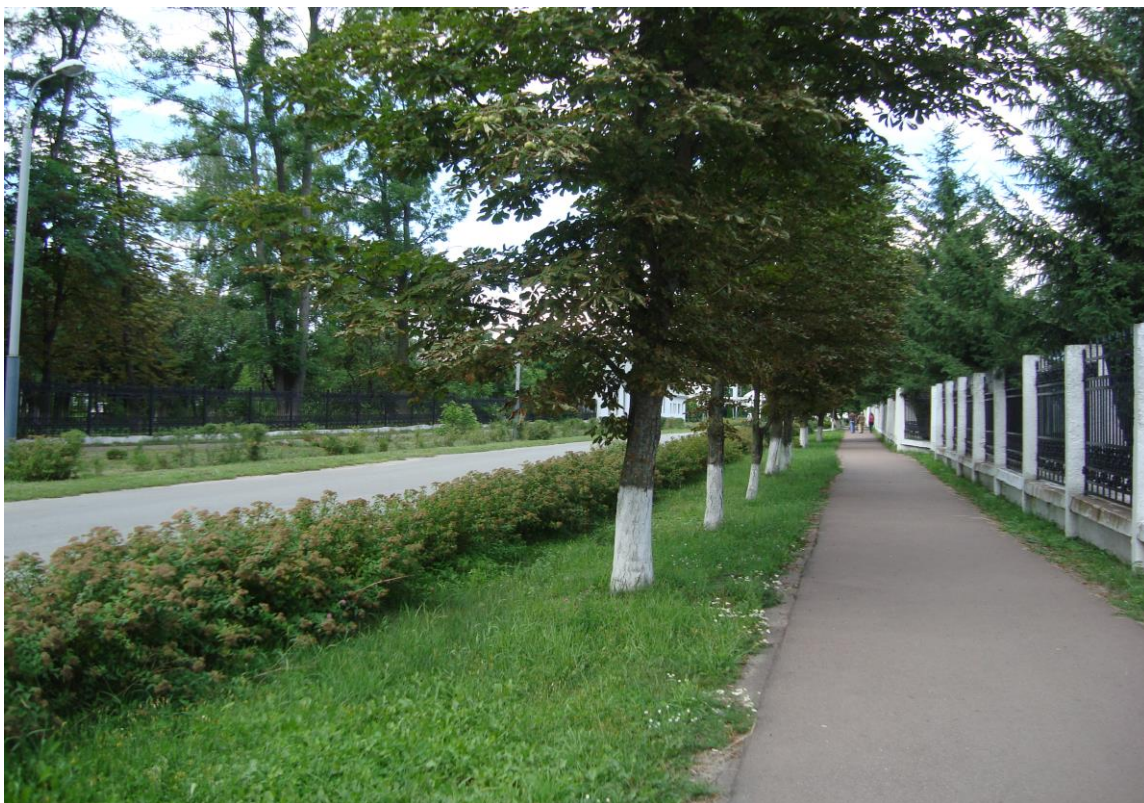
Picture 1. Maystrenko Street (towards “Siversky” hotel and “Spaso-Preobrazhensky” Monastery)